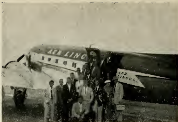
The B.Y.U. team arriving in Ireland.

ered by an article which follows. After the very successful Sunderland Meet, the team continued on to Manchester for the Manchester City Police Annual Sports Meeting in the Manchester White City Stadium on July 18, 1956.